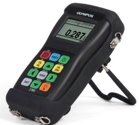
27MG with the optional Protective Rubber Boot with Neck Strap and Gage Stand

Standard inclusions may vary depending on your location. Contact your local distributor.