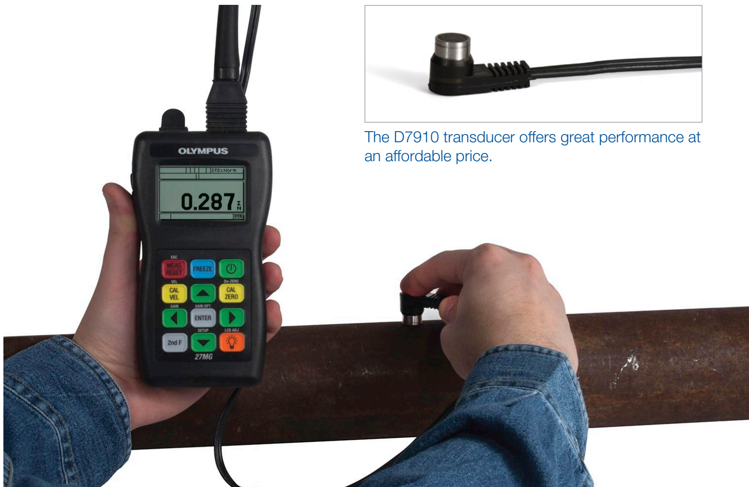
The D7910 transducer offers great performance at an affordable price.

The 27MG thickness gages comes standard with the low-cost D7910 dual element transducer that enables you to make thickness measurements for many basic corrosion applications. For measurements on very thin or thick materials, or small diameter pipes, Olympus has a full line of dual element transducers. Olympus transducers compatible with the 27MG gage feature Automatic Probe Recognition that optimizes transducer performance by automatically recalling the default V-path correction.