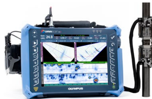
The COBRA scanner on a 0.84 in. pipe with two A15 PA probes, Y-adaptor splitter, and an OmniScan MX2 16:64 flaw detector displaying two PA groups.

This Olympus solution uses low-profile phased array probes with optimized elevation focusing, which enhances detection of small defects in thin-wall pipes. Specially designed low-profile wedges fitting each pipe diameter covered by the scanner are also available for a complete solution. The COBRA scanner ensures stable, constant, and strong pressure, providing good UT signals and precise encoding around the full circumference of the pipe.