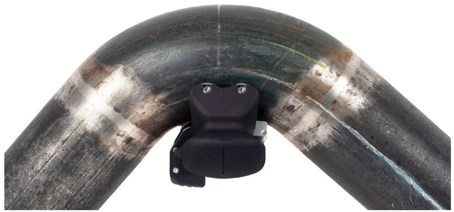
The FlexoFORM scanner inspecting the intrados of a 4.5 in. OD pipe elbow.

Pipe elbows are susceptible to damage, such as from flow-accelerated corrosion (FAC). However, inspecting them poses unique challenges. Because their surface shape changes from convex on the extrados (outside curve) to concave on the intrados (inside curve), and because many diameter standards exist, ultrasonic testing to evaluate damage in the elbow was limited to doing spot check thickness measurements using probes with small footprints.