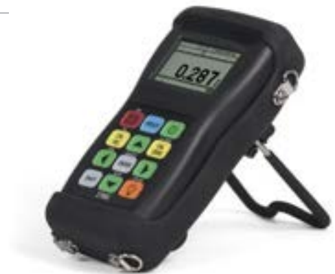
27MG with the optional Protective Rubber Boot with Neck Strap and Gage Stand

Standard inclusions may vary depending on your location. Contact your local distributor.